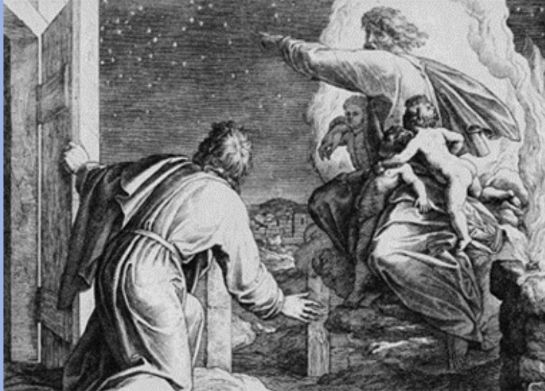
God's Promise to Abram (Genesis 15) (woodcut by Julius Schnorr von Carolsfeld, 1860)

www.standrewskentct.org * 860.927.3486 * st.andrew.kent@snet.net